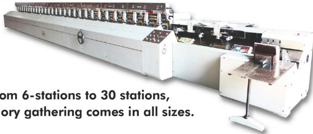
30 Stations side gathering machine installed in Bangalore.

From 6-stations to 30 stations, Glory gathering comes in all sizes.