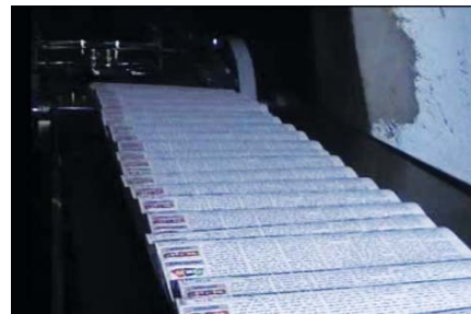
Paper stream goes up to the stacker, with webs up to 80,000 iph