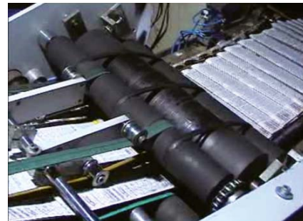
Paper stream from the web, which is flattened with pressure rollers to make a good stack. The antistatic is also applied here.